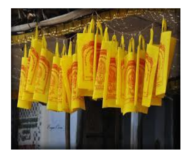
Cloth Bags used for shopping