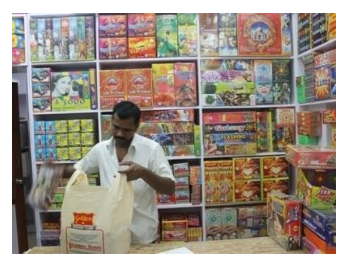
Shop keeper packing items in Plastic bag

Plastics have replaced most of the very basic essentials in our life. When my mom wanted me to purchase something from Annatchi stores (We don't have Super markets at that time) she gave me a cloth bag (Popularly known as Manjal Pai (Yellow Bag)). Annatchi – shopowner fondly called as packed it in the paper and gave it in our cloth bag. Slowly when I entered college – Shops started using the packaged items. Now all the essentials come only in Plastic bags essentially. Or else people started doubting the quality of the product. That is how the branded Tuvar Dal was packaged nowadays and now annatchi to make his Tuvar Dal as branded one he also weighs and packs in different weights 100 Gms, 200 Gms, 250 GMs, 500 Gms. A common man gets satisfied if he sees a packed product in plastic.