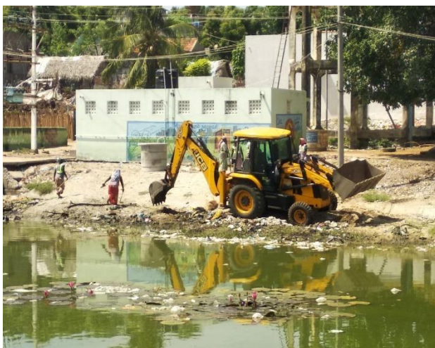
JCB in work

As per the request from the locals on August 14, 2020 Angayarkanni Temple tank located in the Muthuramalinga Thevar Nagar has been desilted and cleaned using JCB and Hand in Hand India Waste Management workers and few more volunteers.