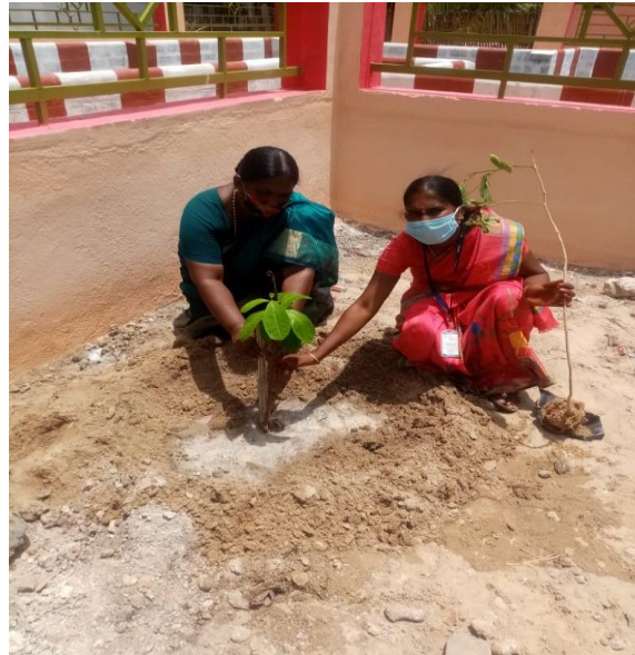
At Panacha Teertham