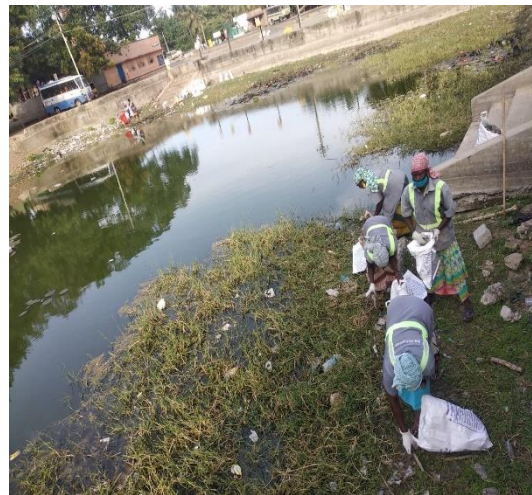
HIH Sanitation workers in action