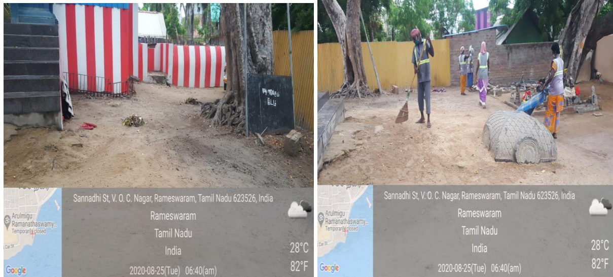
Agasthiyar Teertham cleaning Work by HIH India team

On 25, August 2020 Agasthiyar Teertham cleaning work was carried out by Hand in Hand India Sanitation workers team. Surrounding places including the Agasthiyar temple was also cleaned.