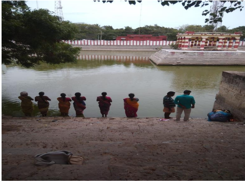
After clearing the debris Teertha pooja was conducted with the volunteers gathered