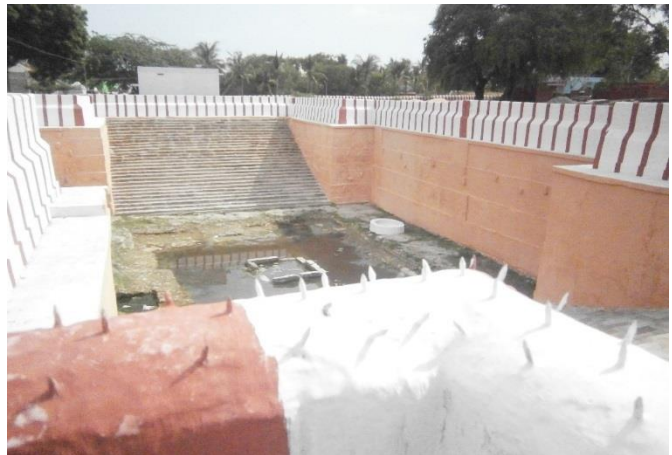
Hanuman Kundam after cleaning