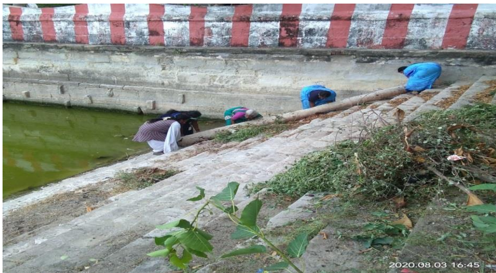
Clearing the tree from the steps

On August 3, 2020 along with Hand in Hand India team, Green Rameswaram have organized a mass cleaning of Ramar Teertham. Around 7 Volunteers participated in the event. We could clear the debris fallen in the steps of the Ramar Teertham and one tree has fallen aside in the steps that has been cleared.