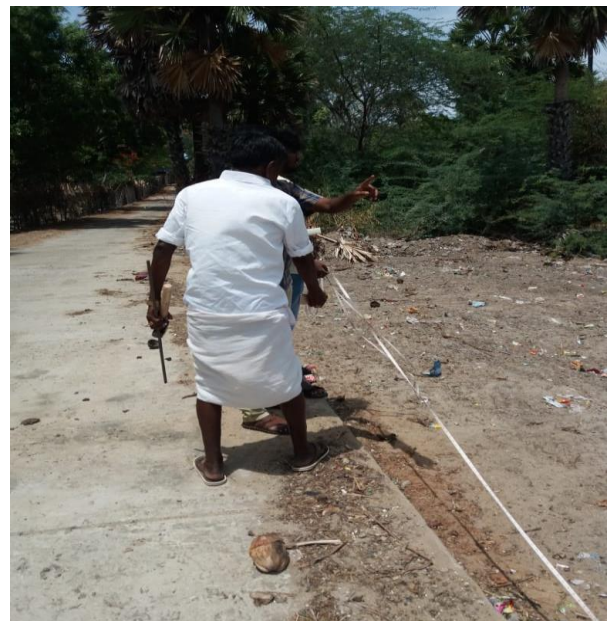
Revenue Department Officials measuring the Bhima Teertham