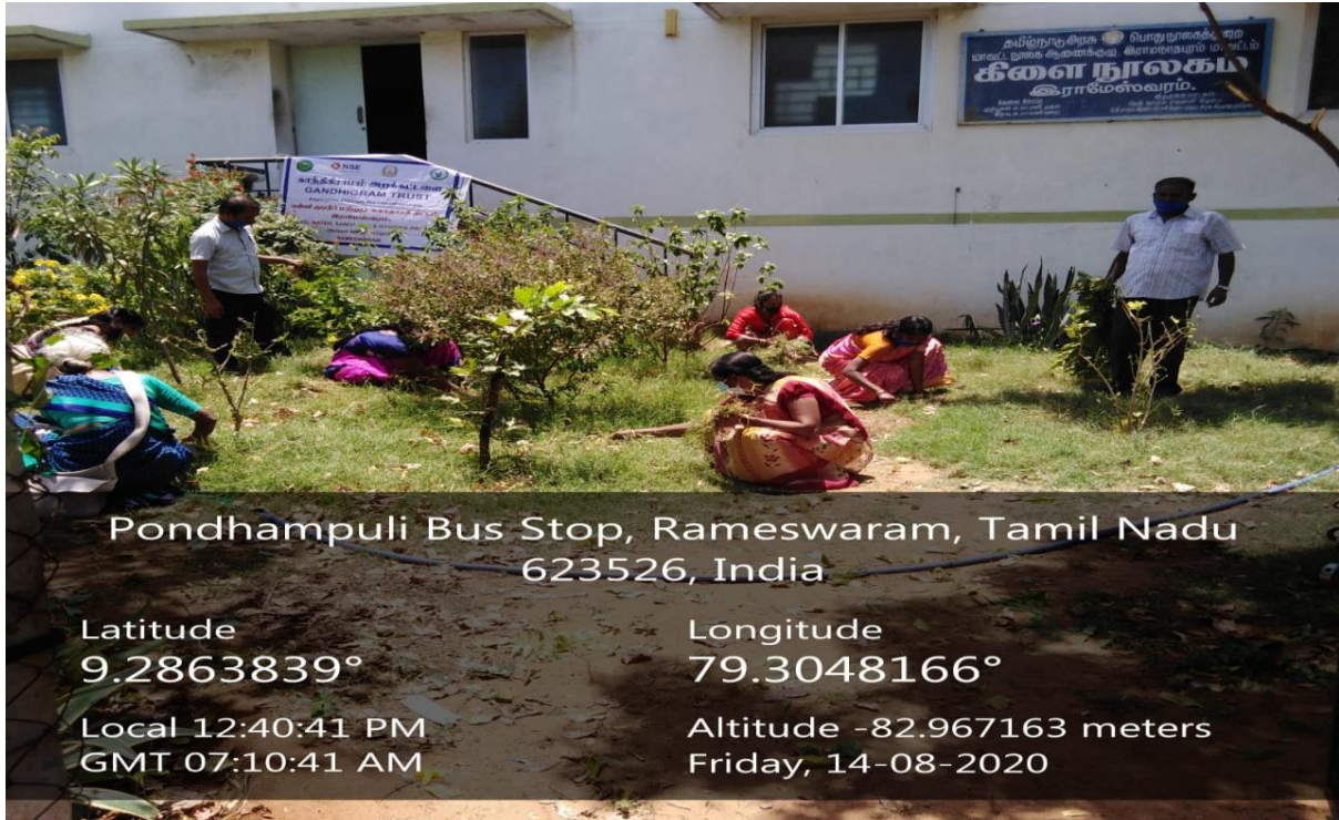
Cleaning of the surroundings of Kalam library