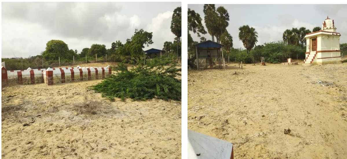
Kumutha Teertham Cleaning

Kumutha Teertham cleaning was done on August 26th, 2020 with the support of Hand in Hand India Waste Management Team. They also cleaned the Ayyanar Temple surroundings.