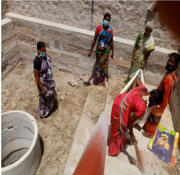
At Hara Teertham

Hara and Panacha Teertham was cleaned with the support of Gandhigram Trust and Hand in Hand India associates Team on August 12, 2020. Both the Teerthams are located in Mankaadu village where we have done extensive works both in water management and other verticals also. 3 plant saplings were planted in each Teertham.