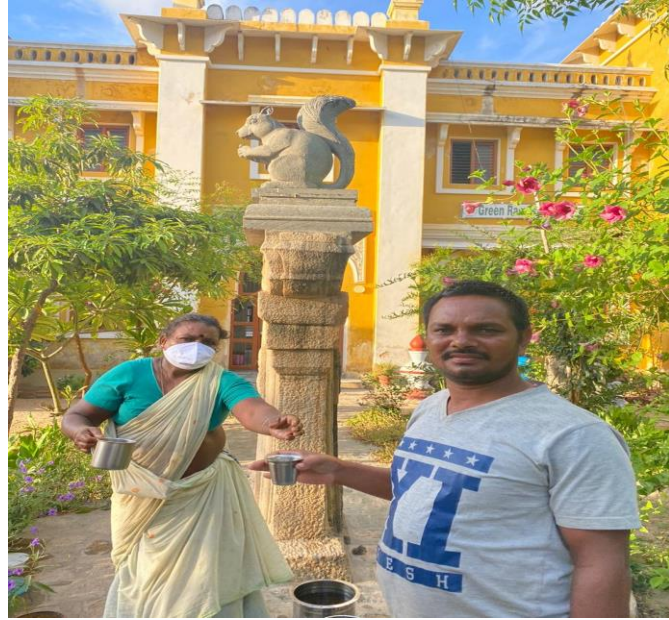
Distribution of Kapha Sura Kudineer kashayam in front of Green Rameswaram Building