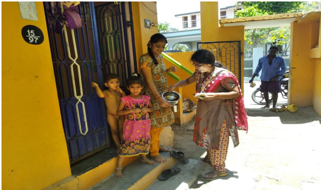
One of our Volunteer distributing Kapha Sura Kudineer

Volunteers also prepared this Kashayam and distributed to locals (100 houses) at in Sallimalai and Sivagami Nagar as well as to Green Friends who are maintaining the cleanliness of Rameswaram town.