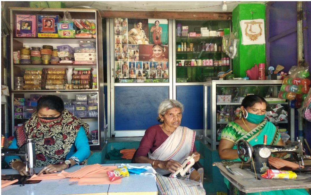
Masks preparation is on ....

220 Metres of non-sanitized cotton cloth was purchased and masks were stitched. Around 1200 Masks were prepared and distributed to the public servants for immediate use.