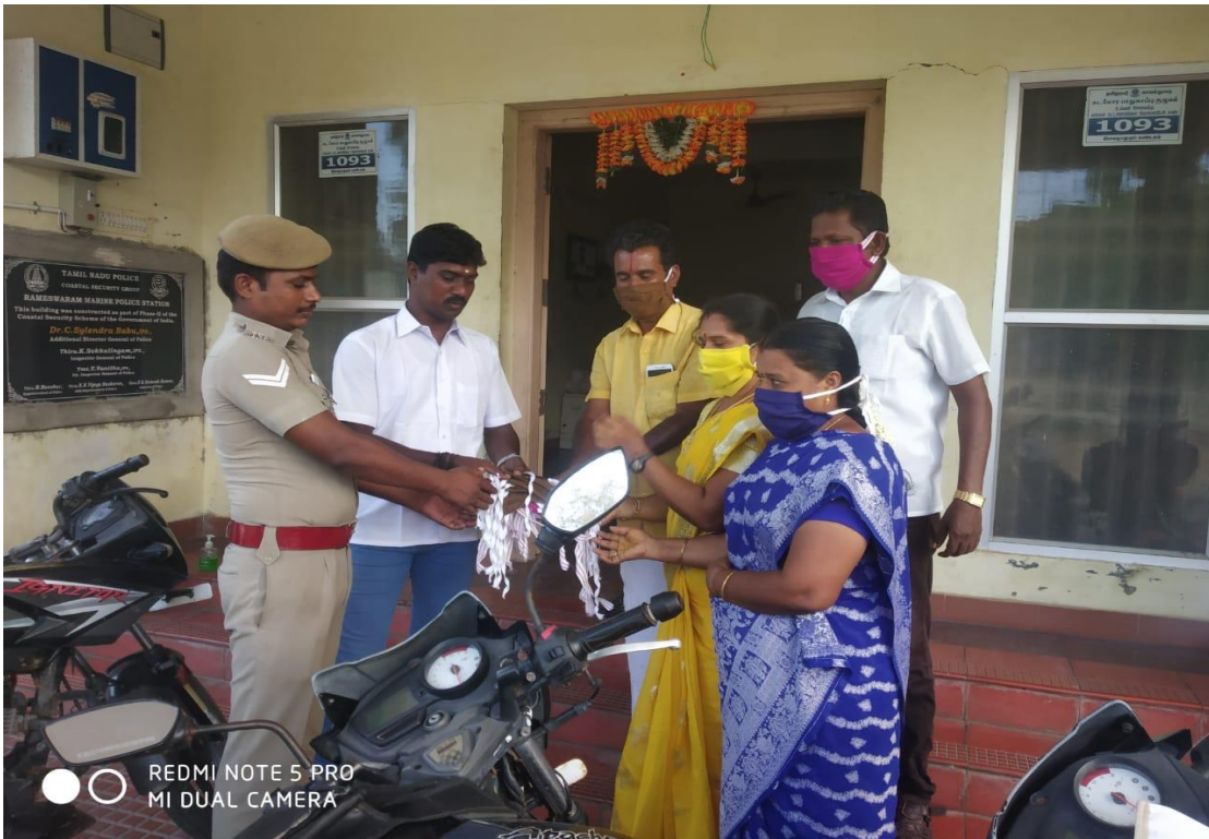
Masks handed over to the police station