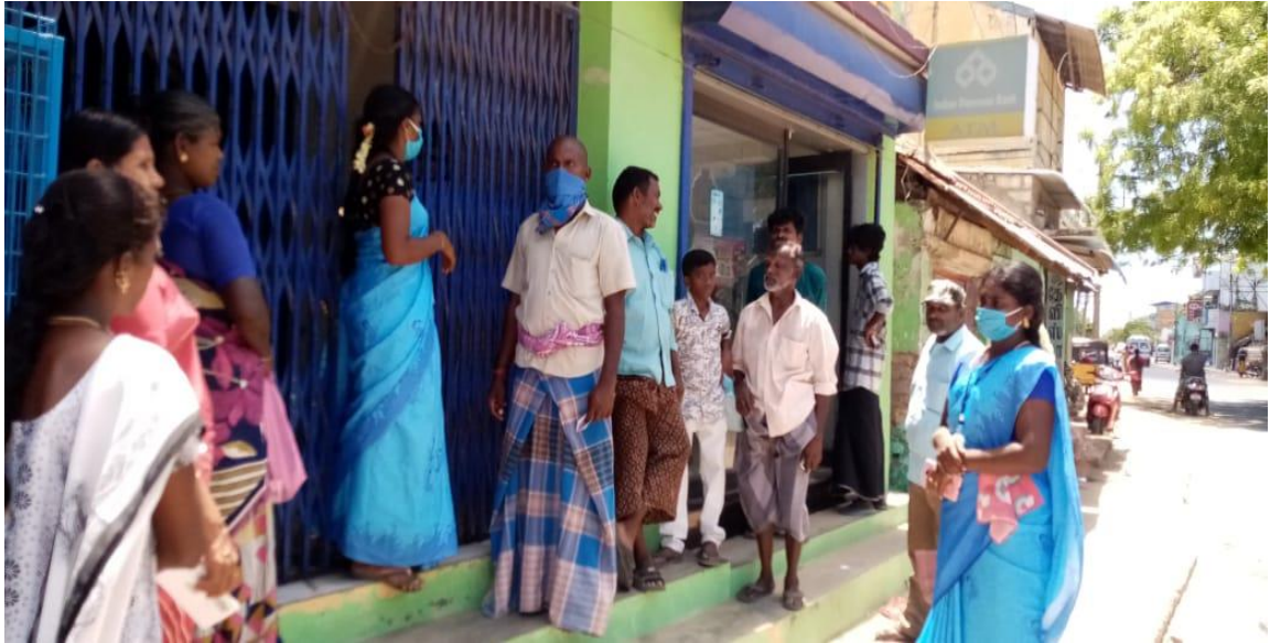
Crowd maintenance by our Green Rameswaram Volunteers in IOB, Thangatchimadam

Our Honourable Prime Minister Shri.Narendra Modi announced a relief of Rs.500 to all Jan dhan account holders. The same amount was credited last month apart from that other reliefs and pensioners withdrawals also coincided last month. As per the request of Shri.Abdul Jaffar, Tahsildhar, Rameswaram, our Green Rameswaram volunteers helped the banks in managing the crowd at two places - Union Bank of India, Rameswaram and Indian Overseas Bank, Thangatchimadam. Volunteers also helped in filling up the forms.