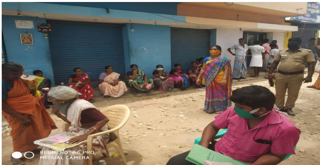
Filling up the forms and guiding the crowd to get the money in UBI, Rameswaram