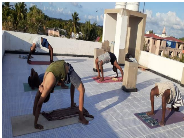
Yoga with Social distance

We are also planning to conduct yoga sessions using Video conferencing tools.