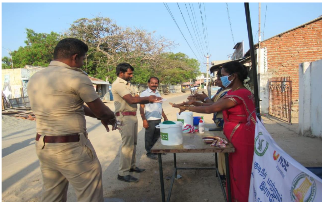
Demonstrating the hand washing techniques to the Policemen