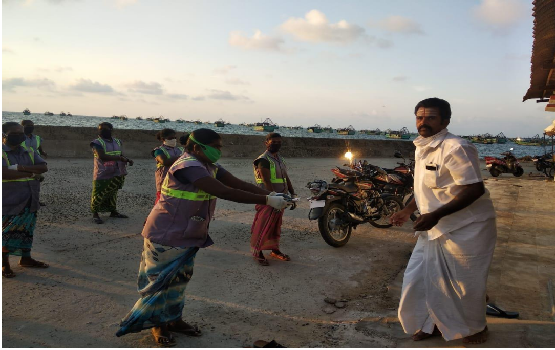
Green Rameswaram Volunteer distributing Kapha sura kudineer packet to the Green Friends