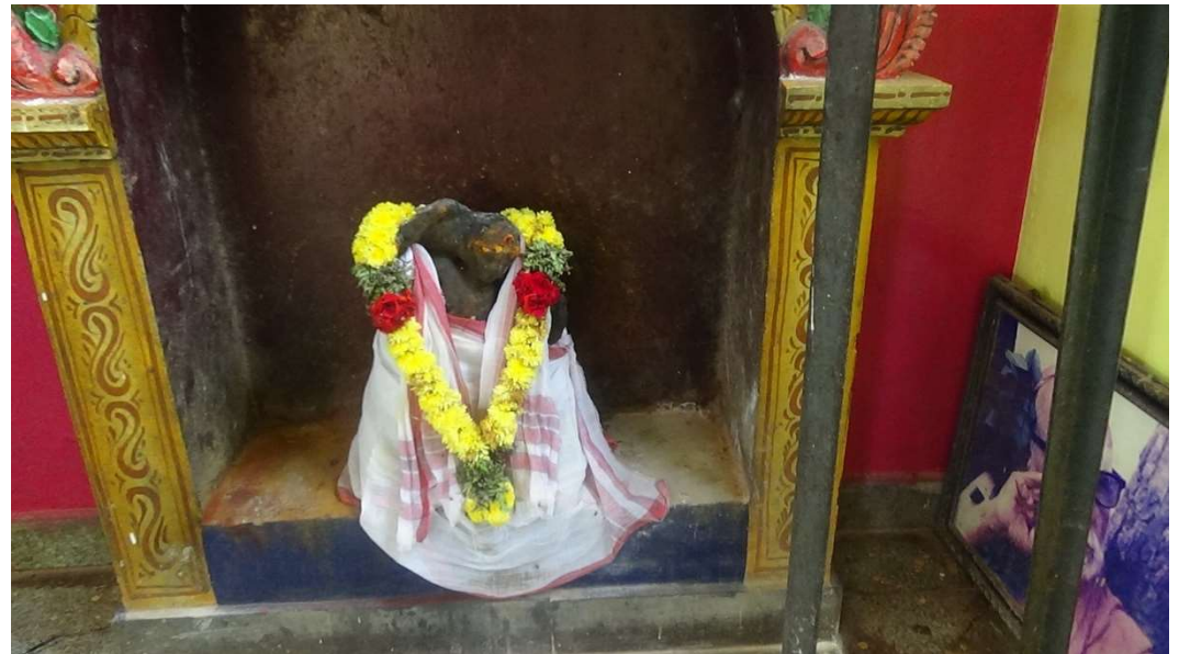
Infront of Amman Right Side Shenbagaperumal is blessing everybody