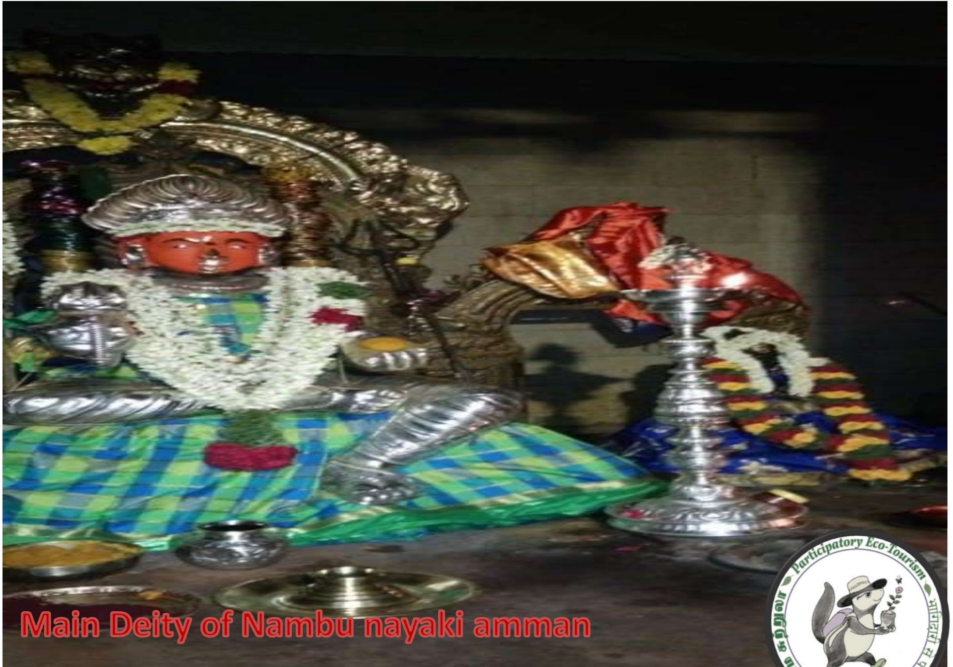
Main Deity of Nambu nayaki amman