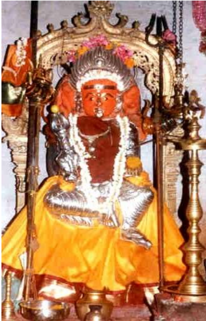
Main Deity of Nambu nayaki amman