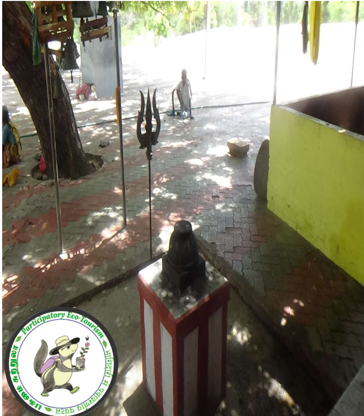
Front Side Parivar Gods Sangili Karuppanasamy