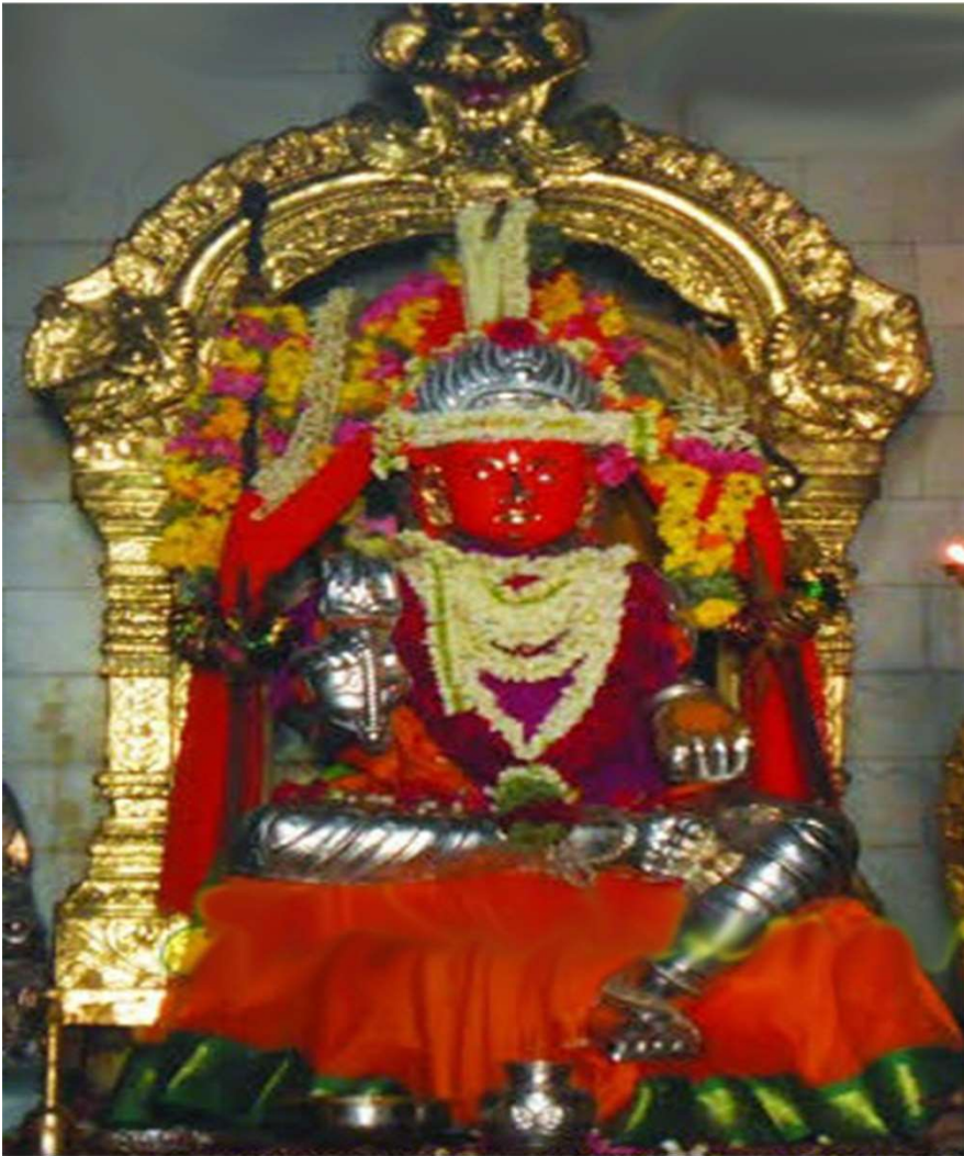
Nambu nayaki amman