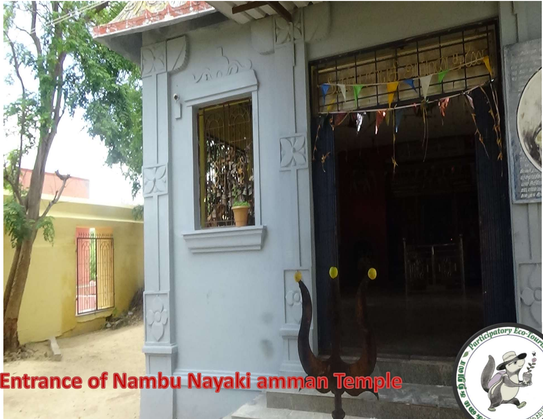
Entrance of Nambu Nayaki amman Temple