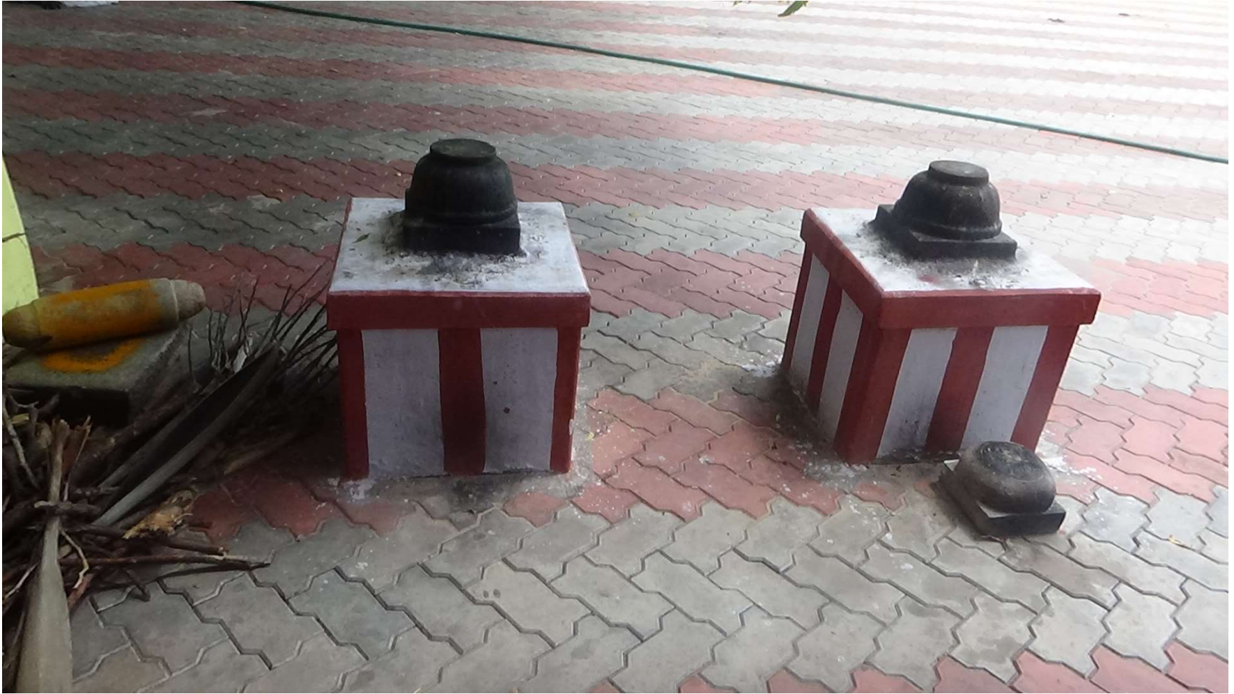
Right Side Parivar Gods Irulan and Maadan