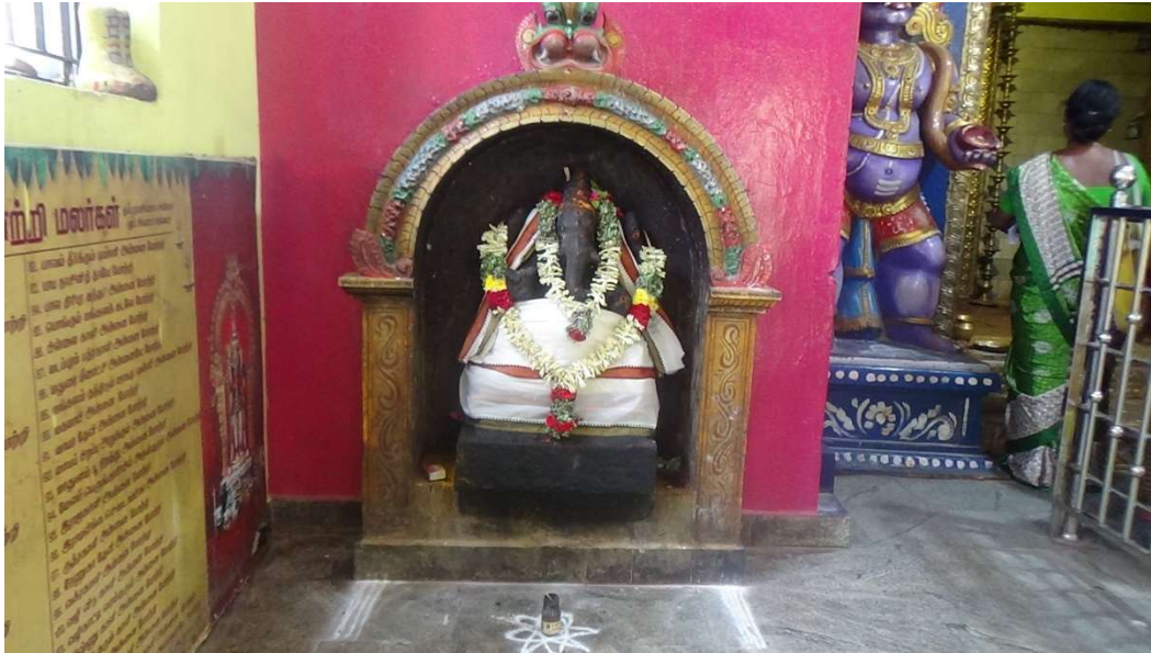
Infront of Amman left side Bala Ganapathy is there