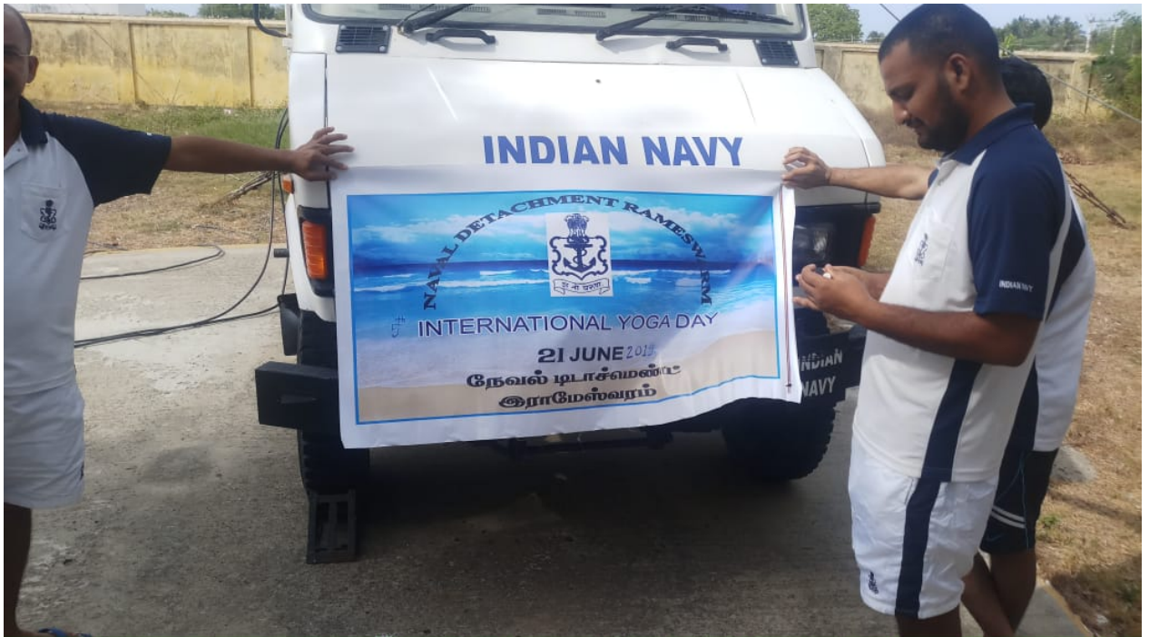
International Yoga Day at Indian Navy camp at Rameswaram