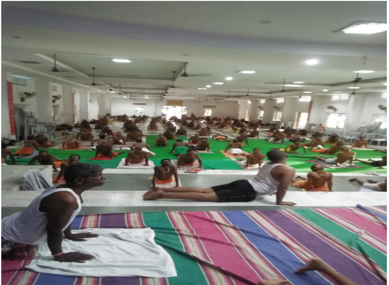
International Yoga Day at Grama Poojarigal Sanga Vedanta training

Goswami Mutt has organized the International Yoga Day celebrations along with the Grama Poojarigal Sangam's Vedanta training. On June 21, 2019 Shri. Hegdeji and his students guided the participants of the training programme in yoga. Around 190 Participants attended. All the participants actively took part in the training. It's a grand function happened from 3 PM to 4.30 PM.