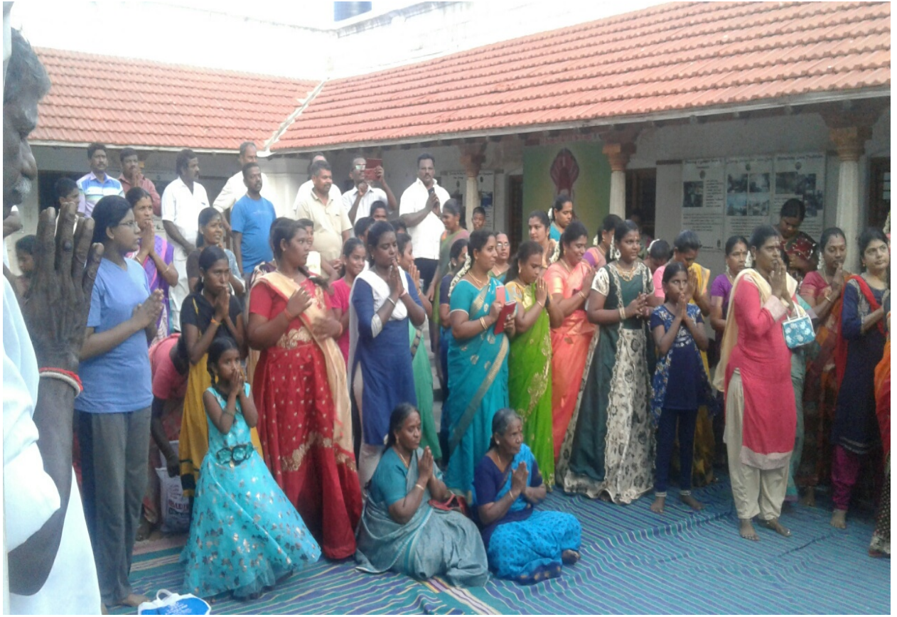
Prayer at Green Rameswaram Building