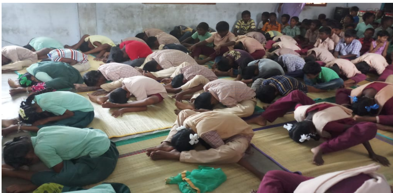
International Yoga day at Panchayat Union Middle School, Rameswaram